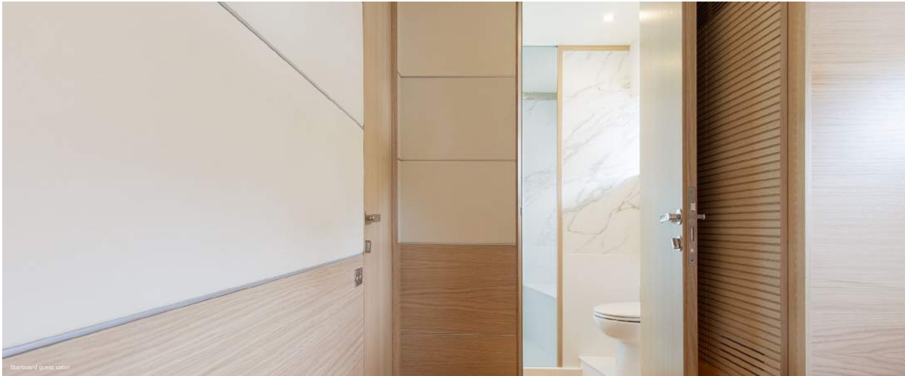
Starboard guest cabin