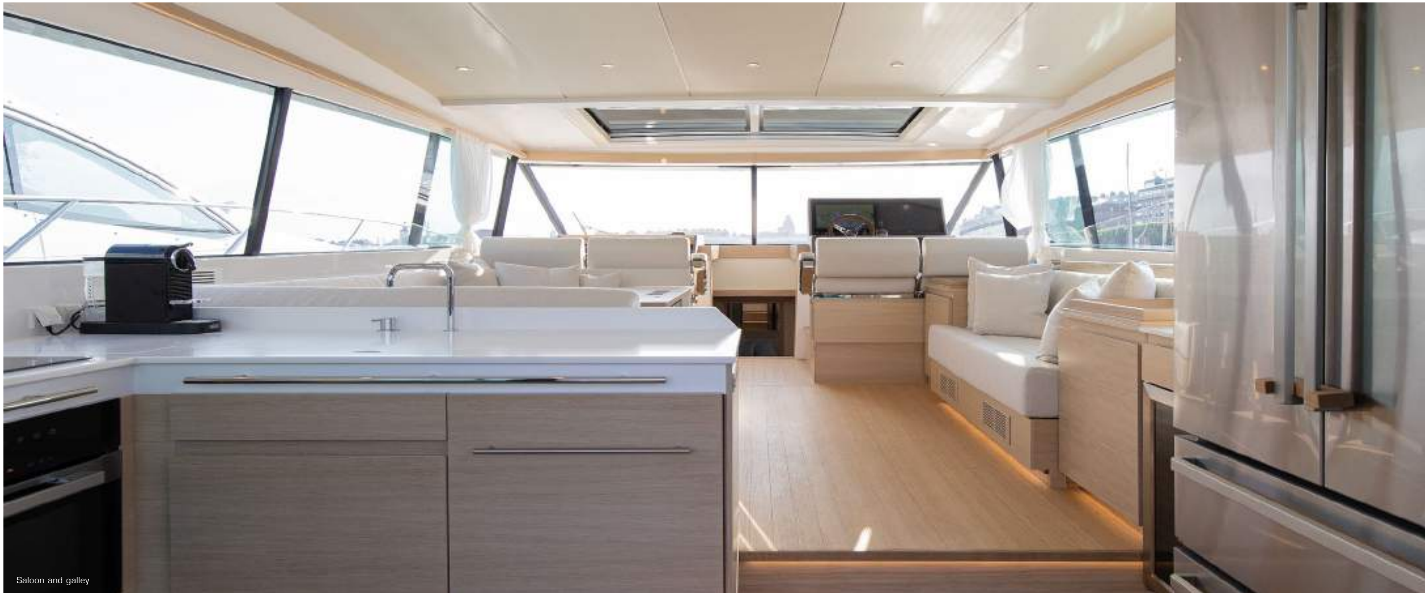
Saloon and galley