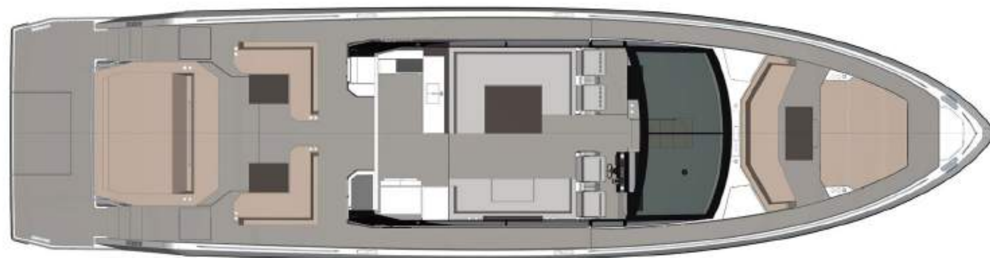
GENERAL ARRANGEMENT Main deck